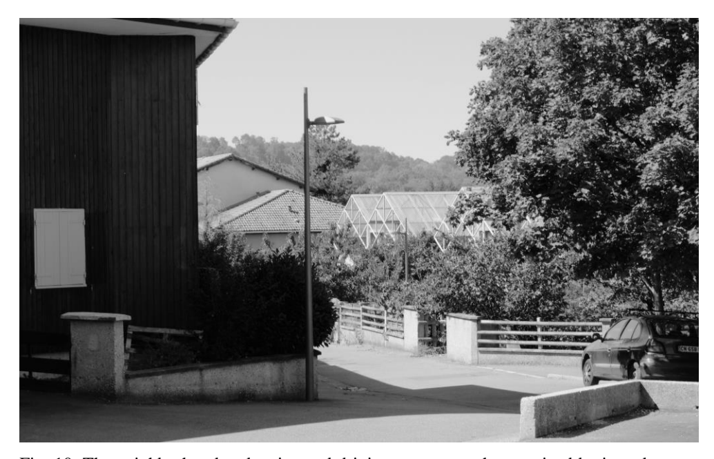
Fig. 10. The neighborhood pedestrian and driving routes are characterized by introductory, guiding and stopping elements. This proves the rich urban structure of this place

This naturalistic network of residential buildings has many features in common with the centers that develop under construction arbitrariness. The streets meander between houses, thereby overcoming considerable differences in the height of the terrain. The numerous guiding elements put the passer-by in a walking mood, the journey becomes a free walk among this specific architecture of the earth village.