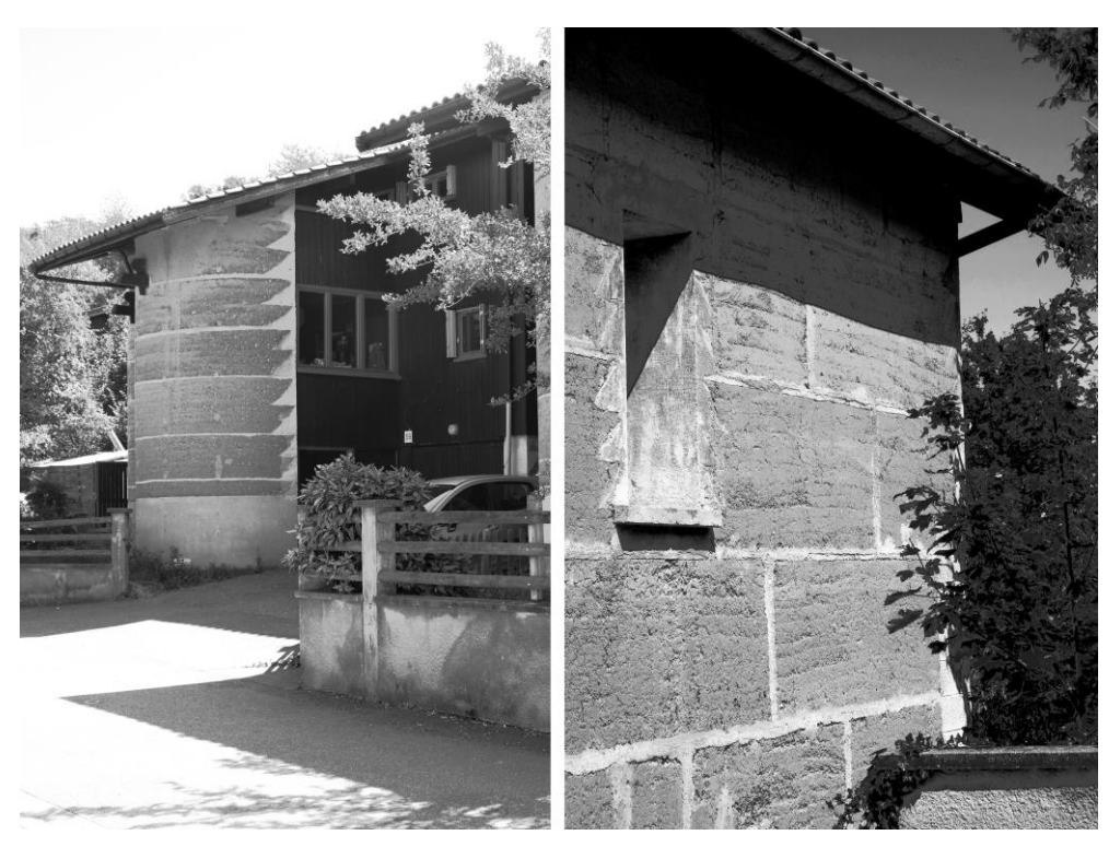
Fig. 5. Îlot 5 – Islet 5, architect: Jean-Vincent BERLOTTIER. A house with four apartments built of compacted earth imitating dried adobe bricks. Wall thickness from 50 cm to 40 cm on the upper floors. The northern facade with cylindrical blocks housing pantries and cellars, the southern facade with glazing in the living room ensuring passive recovery of solar energy. In houses, thermoregulation is carried out by the inertia of earthen floors

After almost 40 years, you can observe good aging of the earth walls. Material deterioration was not observed. The thermal performance remains unchanged from the outset.