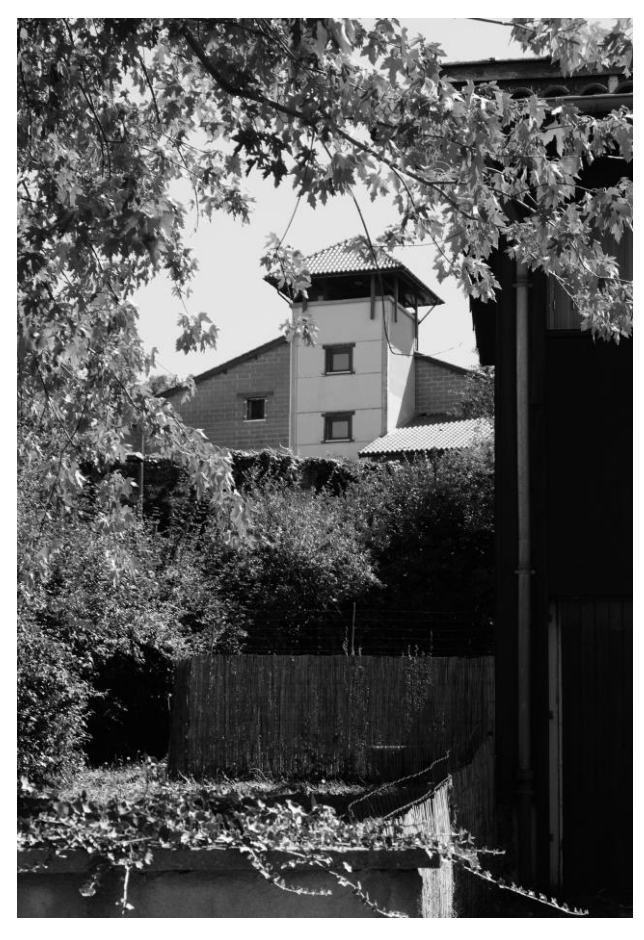
Fig. 13. Îlot 3 – Islet 3, Architect: Jean-Vincent BERLOTTIER; Six apartment blocks are arranged around a 15-meter tower. Each house consists of two parts: a core of adobe blocks made of dried clay and a wooden block containing a living room and a bedroom on the entresole

The dominant feature is the tower, the place of exhibition and cultural animation. This is a village earth tower designed on the central island by architect Jean-Vincent Berlottier to show the possibilities of the material. The fifth floor is open on all four sides and thus offers a small vantage point. It allows for a breathtaking view of the panorama of the city and the region.