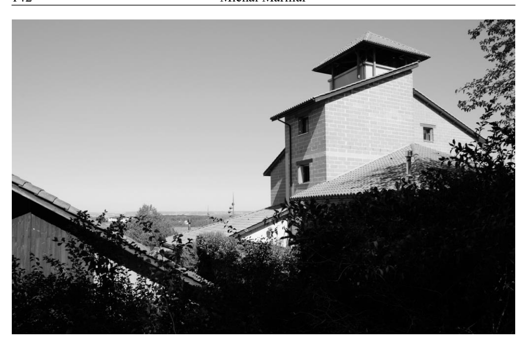
Fig. 7. Masses of earth buildings imitate in their form traditional forms practiced by generations since the times of the first habitats in the region