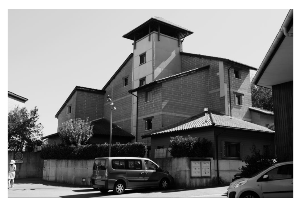
Fig. 14. Islet 3 has become a recognizable symbol of the place

Le Domaine de la Terre tower appears as an emblem in the administrative documents of the town of Villefontaine. Thus, the architectural silhouette acquired the meaning of a landmark.