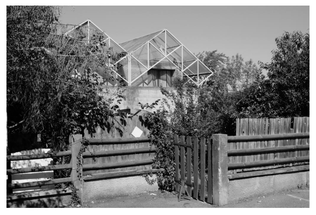
Fig. 8. Architecture and greenery merge with each other throughout the estate