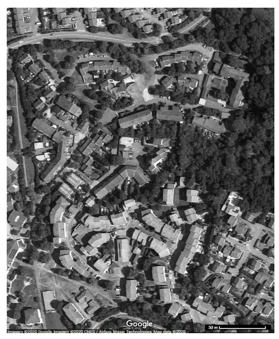
Fig. 2. A satellite image from the Google Earth application showing irregular, plenty of the characteristic urban interiors inside the habitat's urban structure

in Villefontaine is a unique operation known as a site for experimenting with various earth-building techniques in the early 1980s.