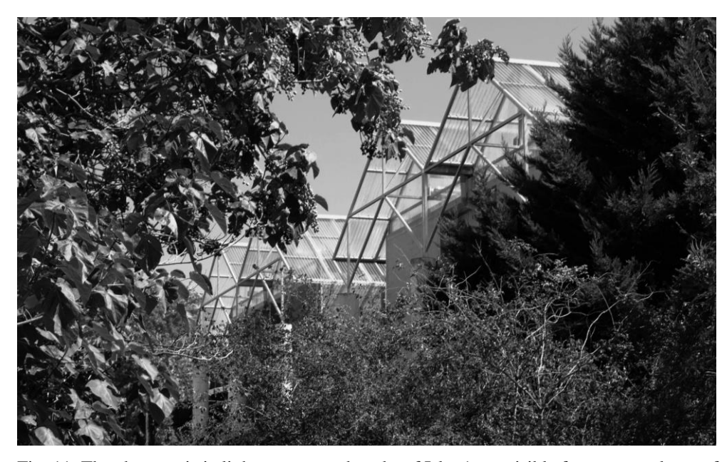
Fig. 11. The characteristic light-constructed peaks of Islet 1 are visible from many places of the complex. They are an excellent landmark that gives way only to a dominant with an unobtrusive form