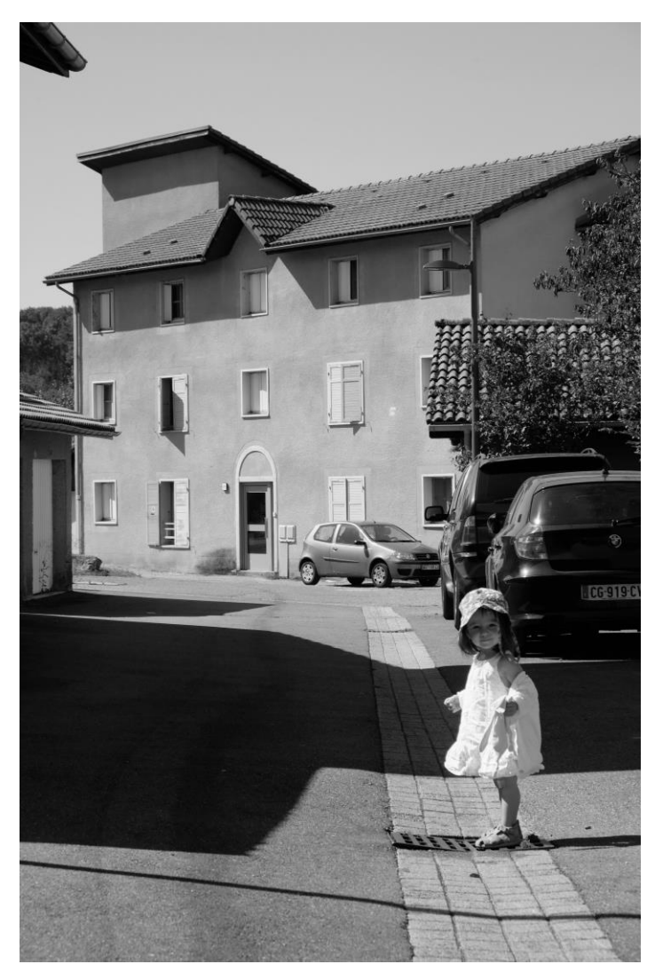
Fig. 1. Street of the Fougères district where it was builta social housing estate built of clay

ly abandoned for decades, has become the building blocks of diverse, experimental projects. Compacted, stabilized and reinforced soil are implemented around these bioclimatic implementations.