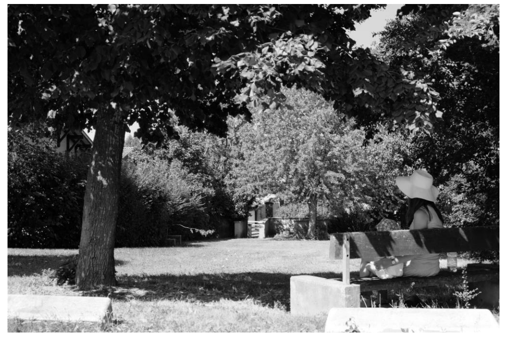
Fig. 12. Green spaces are themselves Domaine de la Terre – the domain of the earth