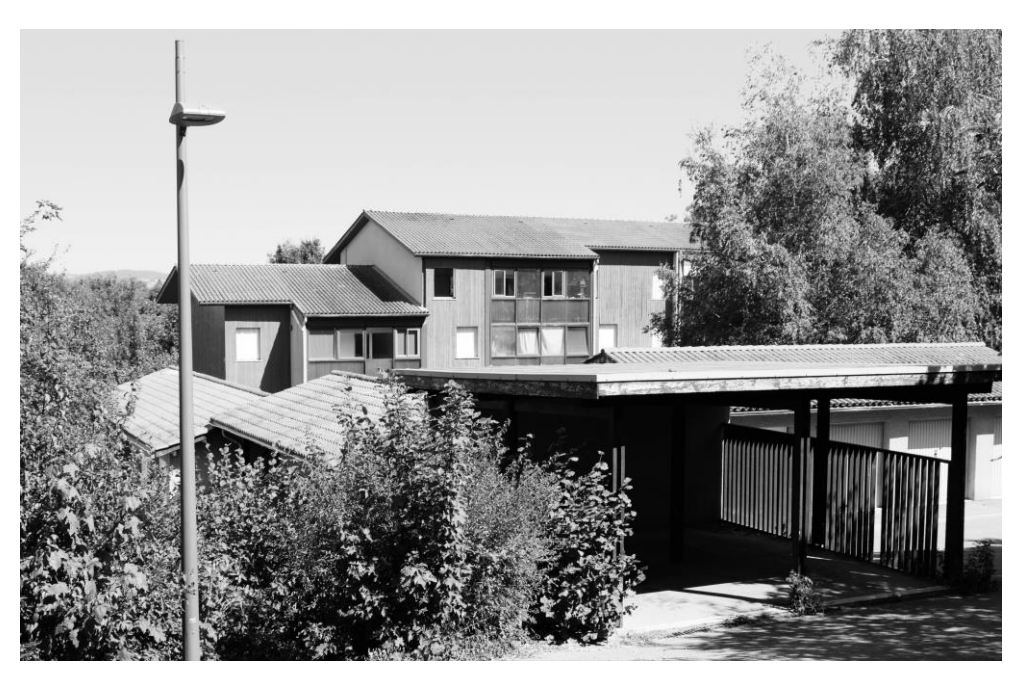
Fig. 6. The architecture of the estate is consistent with the mountainous landscape of the region

The earth estate is located in the Rhône-Alpes region. A characteristic feature of the centers in this region is the horizon line drawn with the peaks of the mountain ranges surrounding the Lyon agglomeration.