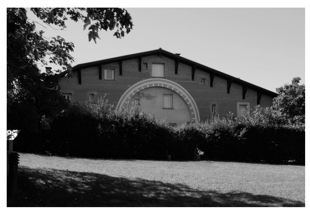
Fig. 4. Îlot 8 – Islet 8, architects: Jean-Michel SAVIGNAT, Odile PERREAU HAM-BURGER, M. MUNTEANU. The property consists of two parts with 6 apartments. Covered with a gable roof, it is a synthesis of vernacular architecture and contemporary form. The silhouette of the building resembles a cat's back. The object is made of dried adobe bricks forming a 45 cm wall

understand the architectural features and values of heritage, and then to define its potential useful in many areas, also in the process of creating and implementing architectural projects, and in this case also urban, rural, etc.