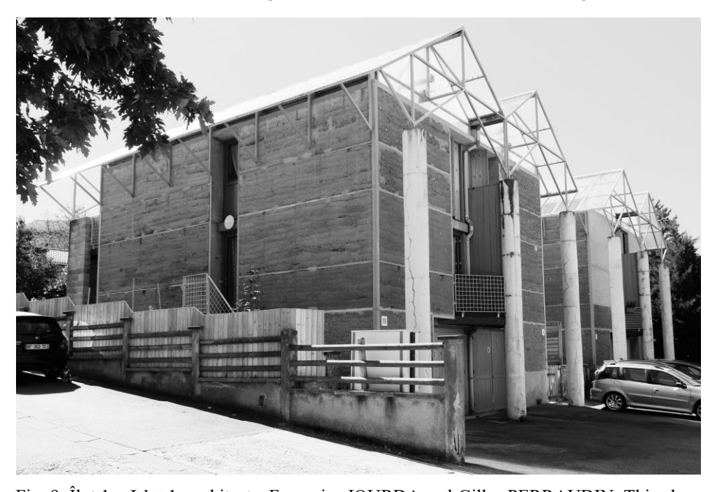
Fig. 9. Îlot 1 – Islet 1, architects: Françoise JOURDA and Gilles PERRAUDIN. This characteristic building contains 4 apartments in a compact block, which, together with insulation from compacted earth, ensures a minimum level of energy losses. The resulting lumps, fastened with steel frames, adopt the features of the surrounding agricultural sheds through their weight and architectural expression. The principle of a thick, double-skinned façade allows for the organization of buffer spaces and terrace structures adapted to the conditions of sunlight and air conditioning

The geographic and topographic location makes the estate unique. Natural factors to which a person has to adapt influence the rich, varied architectural and urban shape of the space. Diverse architecture in the spirit of postmodernism, built from native materials, in its form imitates the local solutions from the Dauphinoise region, where 80% of houses built before 1950 were in adobe technology (the name of adobe technology is common to languages derived from Latin), i.e. dried brick also known as "raw earth". It is therefore a great reference to the tradition of the region.